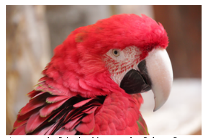
A parrot in the Columbus Museum in Las Palmas, Canary Islands