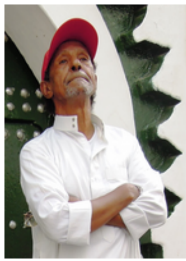
Our energetic guide in the Tangier Kasbah kept us moving.

He took us to an artist's cooperative where my wife and I were offered a beautiful red necklace for 120 Euros – far too much for us. As we were leaving the shop twenty minutes later, the merchant came approached me and said, "What price will you pay for the necklace?" I blurted out "Twenty Euros," and the deal was sealed -- a drop of 83 percent from the original asking price.