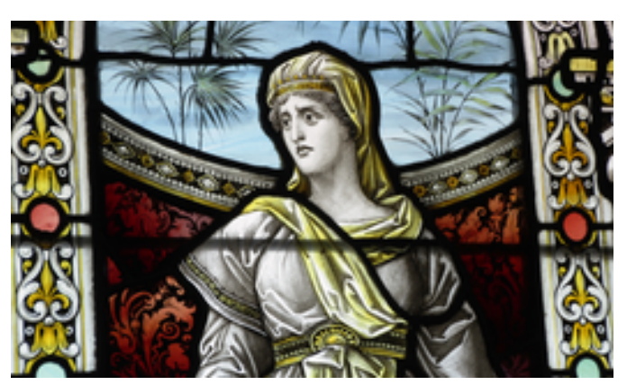
Victorian glass in Malaga, Spain.