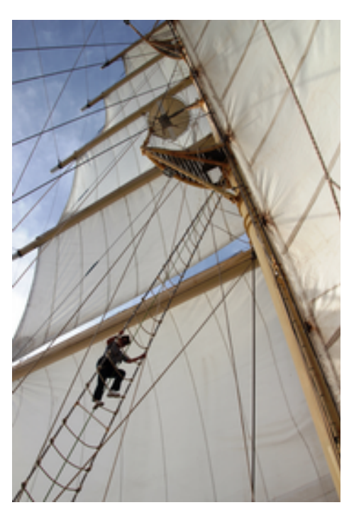
A passenger climbs the mast on Star Flyer.

Last month we began describing a cruise on the tall ship Star Flyer from Malaga, Spain to Grand Canary island in the Atlantic. This month we will discuss climbing the mast, the food on board, ship's tours, and a minor accident that affected the ship's schedule.